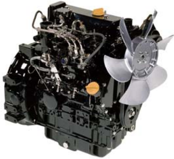
Image shown may not be actual engine